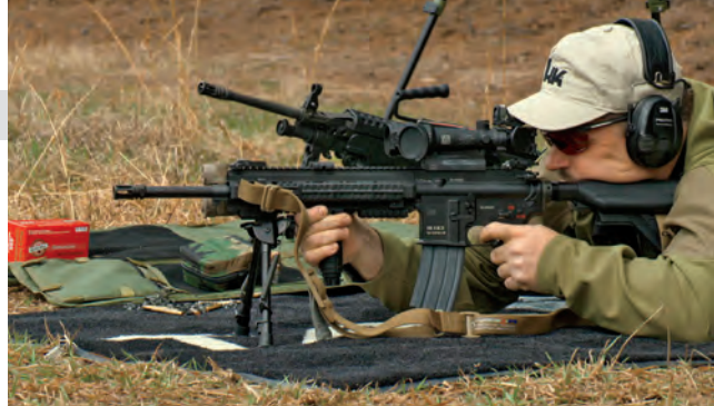
The author is seen here testing the M27 IAR alongside the M249 SAW while on the set filming an upcoming episode of “TacTV” that can be viewed on the Sportsman Channel or tac-tv.com.

After shooting at a target 50 yards away and doing a series of shorts bursts with all three firearms from their normal prone full-auto support positions (M16A4 magazine monopod, bipod for the other two), the results were interesting. The M16A4 and SAW had nearly the exact same dispersion, while the M27 was dramatically less. In our opinion, the reason for this was the slightly higher cyclic rate on automatic and the greater stability offered from the Harris/LaRue bipod assembly. One advantage that was immediately seen was the ability to track all the shots of the burst using the highly visible partial-donut-style reticle of the optic issued with the M27, the Trijicon ACOG 3.5x35 Squad Day Optic. This is the same optic being used by the Marine Corp for the M249, so it made sense to carry it over for use on the M27. It has a Trijicon RMR red dot reflex sight mounted in