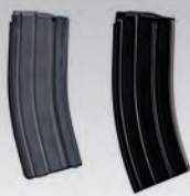
30-round magazines (U.S.G.I. and optional HK steel magazines)