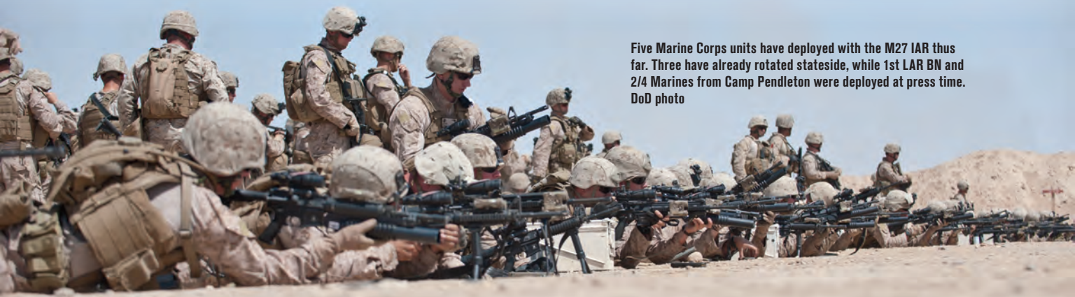
Five Marine Corps units have deployed with the M27 IAR thus far. Three have already rotated stateside, while 1st LAR BN and 2/4 Marines from Camp Pendleton were deployed at press time.

A steel torso-size target was placed at 100 yards, then another at 300. The test was to put one short burst on the close steel, then attempt to engage the far steel with one precise shot. Once again, first up was the M16A4, which suffered again from the monopod shooting position, as only one hit was recorded on the 100-yard steel. Switch to semiauto and the 300-yard shot was child’s play, as it was fitted with a Trijicon ACOG also similar to the one issued on that platform within the Corps. Next up was the SAW, which excelled at the close steel. Surprisingly, I got the first hit on the far target of a very short burst. At this point it became clear why the Israelis put a semiauto as well as full-auto mode on their Negev 5.56mm LMG. The M249 is way overdue for this upgrade. And, as expected, this test was a cakewalk for the M27. With the prone bipod-supported stability, the slightly higher cyclic rate and the ability to switch to semi for the long shot, the stage was set to dominate, and it