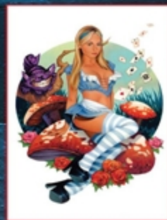
BEYOND COMICS EXCLUSIVE COVER LIMITED TO 500 COPIES DAVE NESTLER